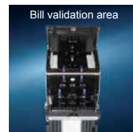
Bill validation area

With the currenza ® bill validators your operation will be more reliable and profitable.